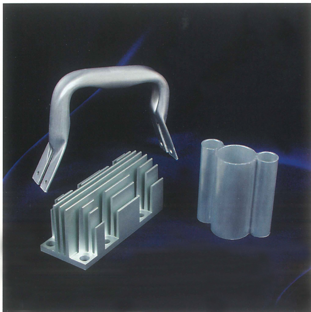
Clockwise from bottom left: heat sink for electrical controls, heat gun handle, fishing net yoke.

Our capabilities don't stop with the extrusion process. We are also equipped to handle a variety of secondary operations, including: